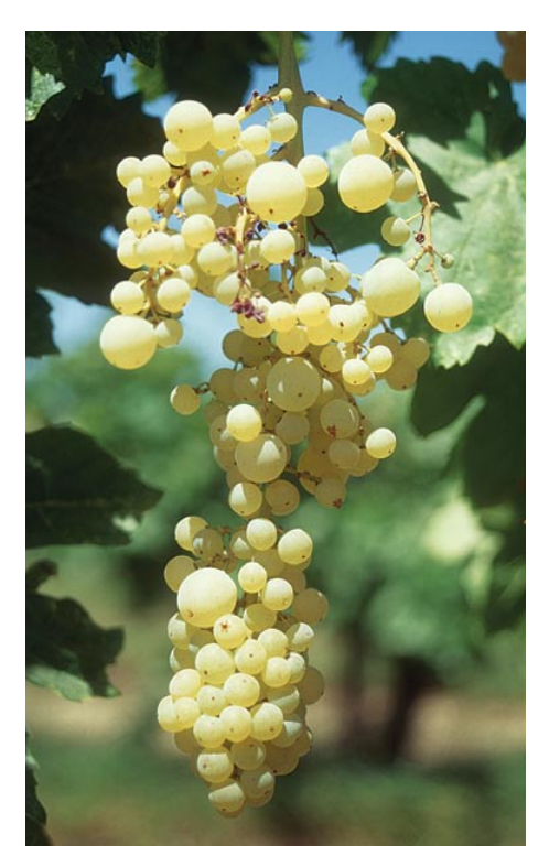
Boron foliar sprays applied in the fall were the most effective treatment to prevent, above, boron deficiency symptoms in grapes.

ments were an untreated control and a foliar boron spray at 1 pound per acre applied as Solubor (20.5% boron) at 100 gallons per acre (gpa). The trial design was a randomized complete block with four-vine plots, replicated 10 times. Vine tissue samples were taken at bloom on May 23, 1998; triple-rinsed with distilled water and oven-dried; and analyzed for boron at the ANR Analytical Laboratory at UC Davis.