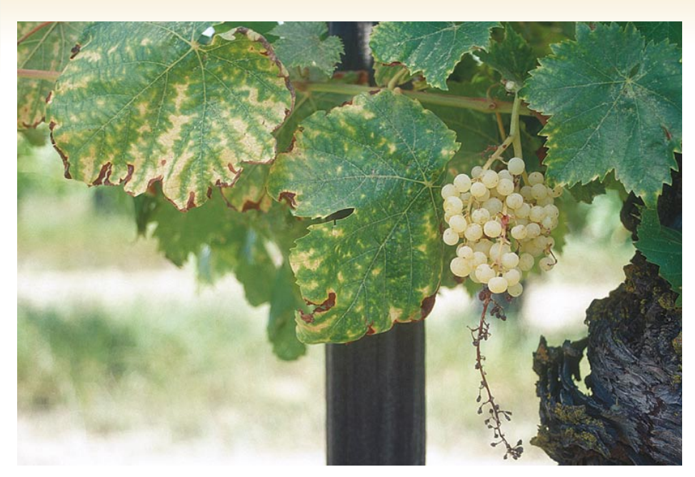
A boron-deficient Thompson Seedless cluster in the trial vineyard shows reduced fruit-set, the presence of numerous pumpkin-shaped "shot berries" and necrosis of some branching. Fewer than 10% of the berries are normal size and shape.

Grapevine reproductive tissues are most sensitive to boron deficiency, which results in reduced fruit-set, small "shot berries" that are round to