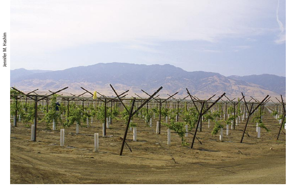
Boron deficiencies are common in the old flood plains and alluvial fans of California's Central Valley. Above, a newly planted table grape vineyard.

grapevines are susceptible to temporary boron deficiency of developing tissues during periods of drought, suggesting limited boron mobility.