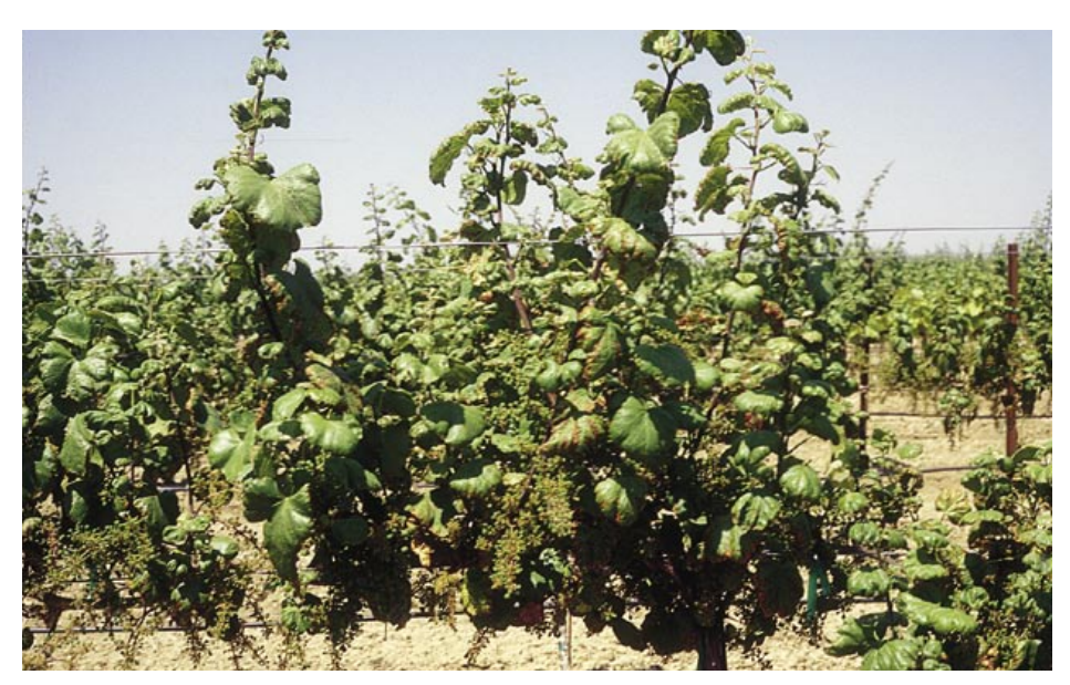
Symptoms of boron toxicity include leaves that are cupped downward with necrotic margins on mature leaves.

The results of this research can be applied to other drip-irrigated vineyards in the San Joaquin Valley under similar conditions: rapidly drained soils, highquality irrigation water, and low boron content in soil, water and vine tissue. In other regions of the state where winter rainfall is much higher, there would presumably be more leaching of boron fertilizer during winter months and less carryover time after fertilization is discontinued. In contrast, less leaching and greater carryover of boron would be expected in areas of less rainfall or on soils with finer texture and higher water-holding capacity. The amount of boron fertigation used in a maintenance program will vary with leaching potential. These variables underscore the importance of monitoring boron in tissue when developing a long-term fertilization program.